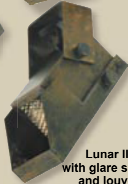
Lunar III with glare shield and louver Ancient Bronze-5 DL-133-210-224-5