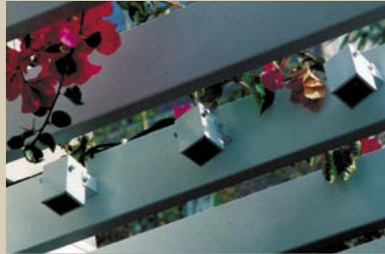
Lunar II mounted in trellis DL-104-224-4

Lamping: MR-11 MR-16/FG (with lens): 20W / 35W / 50W For 12V remote transformer