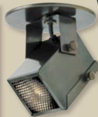
Lunar II with canopy mount and honey comb louder Copper Bronze-3 DL-104-224-231-3